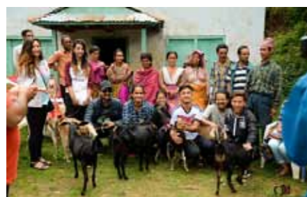
Distribution goats for income generation at Tistung, Makwanpur (June 21, 2016)

Marking the 20th anniversary of the College, as many as 53 students, faculties