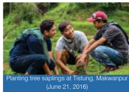
Planting tree saplings at Tistung, Makwanpur (June 21, 2016)

students in groups have collected data for estimating various development indicators viz Human Development Index, Human Poverty Index and Gini Index. They also linked the field data with the Millennium Development Goals, Sustainable Development Goals and Sustainable Livelihood Models. The local communities happily cooperated with the faculties and students, since the regular field studies conducted by the National College have been beneficial to them.